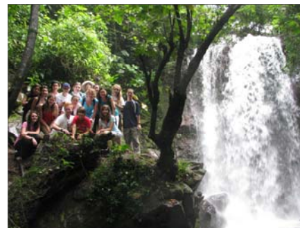
Group excursion celebrating 'good life'

Why not add " Pura Vida " to your summer 2011 www.yrdsb.edu.on.ca/ice - Costa Rica