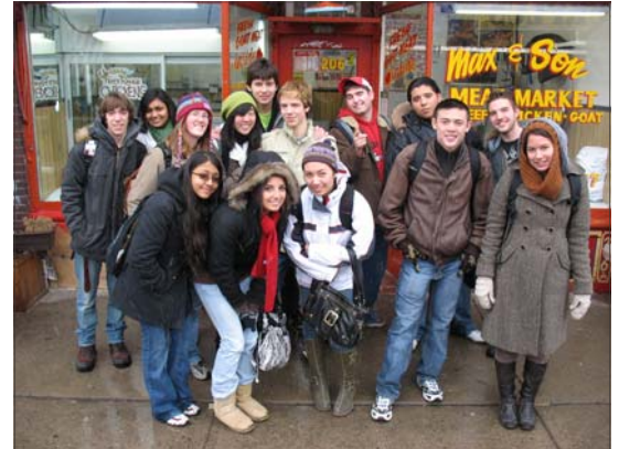
The 2008 ICE Team - Kensington Market field trip

Yet ICE is so much more than going overseas!